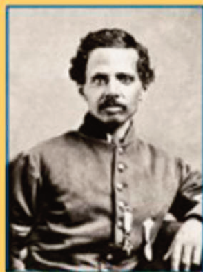
Powhatan Beaty